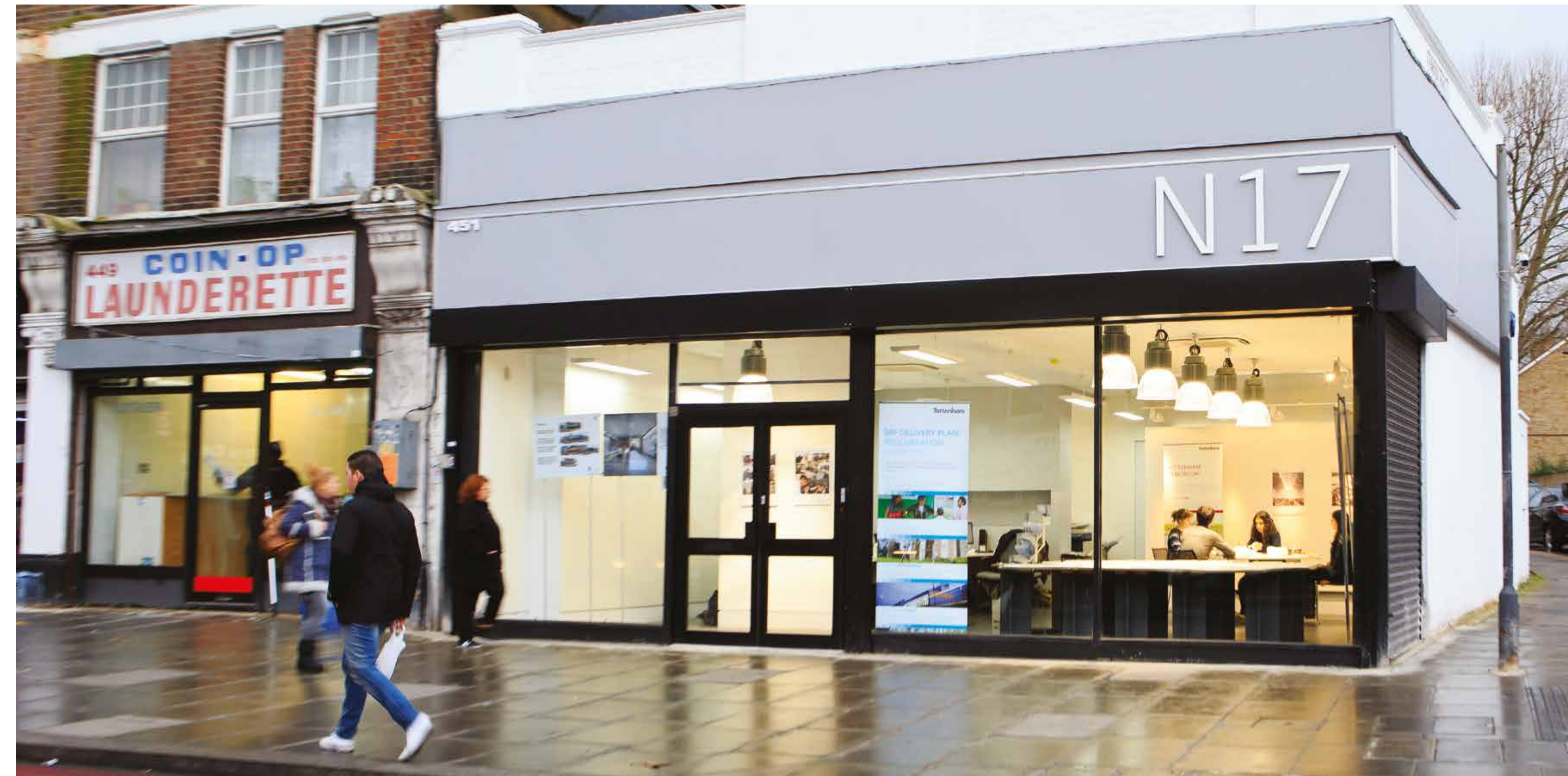
N17 Design Studio