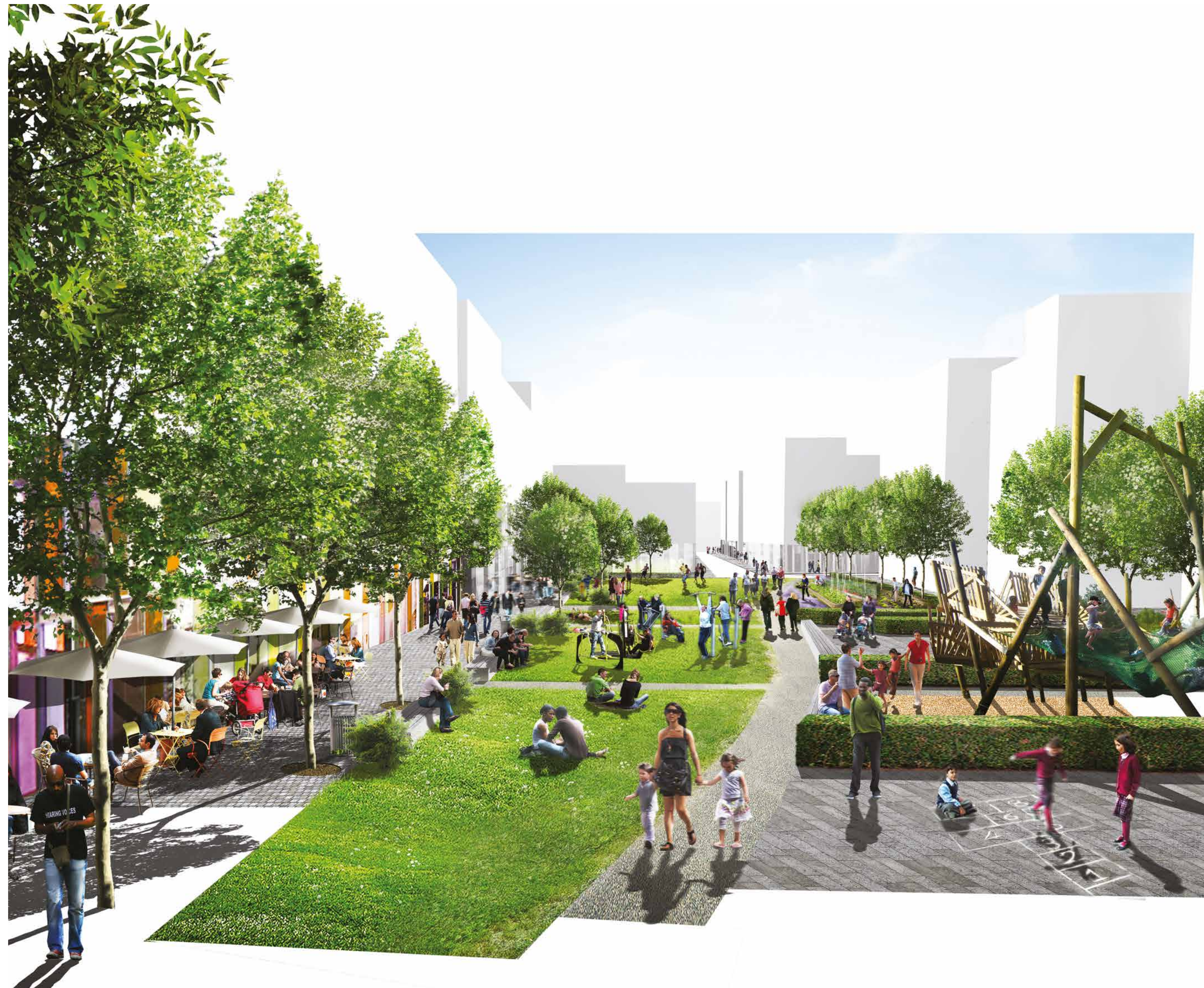
Potential new public open space in High Road West